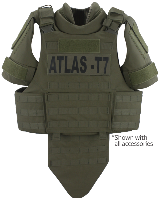
*Shown with all accessories