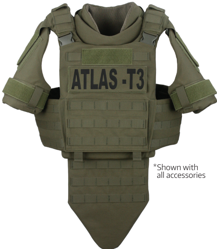
*Shown with all accessories