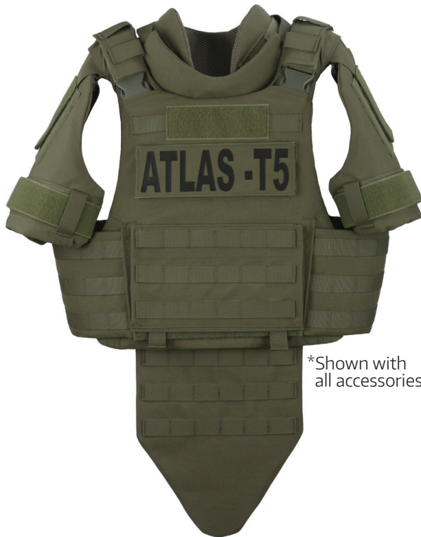
*Shown with all accessories