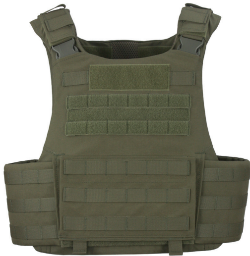
*Shown with cummerbund

Part of the Atlas Tactical Series, the Atlas T5 Extended Coverage Tactical Vest is designed for operators that require lightweight protective coverage and high-speed mobility. Engineered as a scalable ballistic platform with optional quick release functionality and a range of accessories that are compatible with all Atlas series vests. The Atlas T5 offers a low-profile solution that is fully customizable with soft and hard armor inserts for mission-specific adaptability.