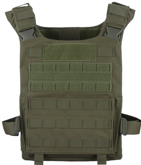
*Shown without cummerbund

Part of the Atlas Tactical Series, the Atlas T3 Tactical Plate Carrier is designed for operators that require lightweight protective coverage and high-speed mobility. Engineered as a scalable ballistic platform with optional quick release functionality and a range of accessories that are compatible with all Atlas series vests. The Atlas T3 offers a low-profile solution that is fully customizable with soft and hard armor inserts for mission-specific adaptability.