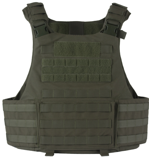
*Shown with cummerbund

Part of the Atlas Tactical Series, the Atlas T7 Full Coverage Tactical Vest is designed for operators that require lightweight protective coverage and high-speed mobility. Engineered as a scalable ballistic platform with optional quick release functionality and a range of accessories that are compatible with all Atlas series vests. The Atlas T7 offers a low-profile solution that is fully customizable with soft and hard armor inserts for mission-specific adaptability.