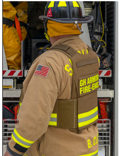
*Image shows PH4.FR style, w/out MOLLE