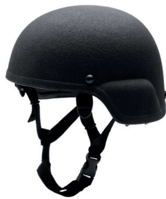
ACH Level IIIA Helmet, Full-Cut, Mid-Cut or High-Cut

Part # GH-HB2-ACH-F-RET GH-HB2-ACH-M-RET GH-HB2-ACH-H-RET