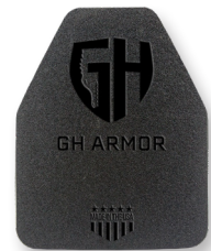
Level III NIJ 06 Poly Rifle Plate Shooter's Cut