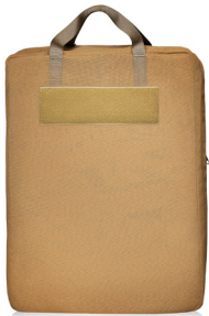
Premium Carry Bag Holds Carrier/Plates/ Helmet