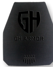
Level III+ NIJ 06 Steel Rifle Plate Shooter's Cut

Part # GH-HB2-ACH-F-RET GH-HB2-ACH-M-RET GH-HB2-ACH-H-RET