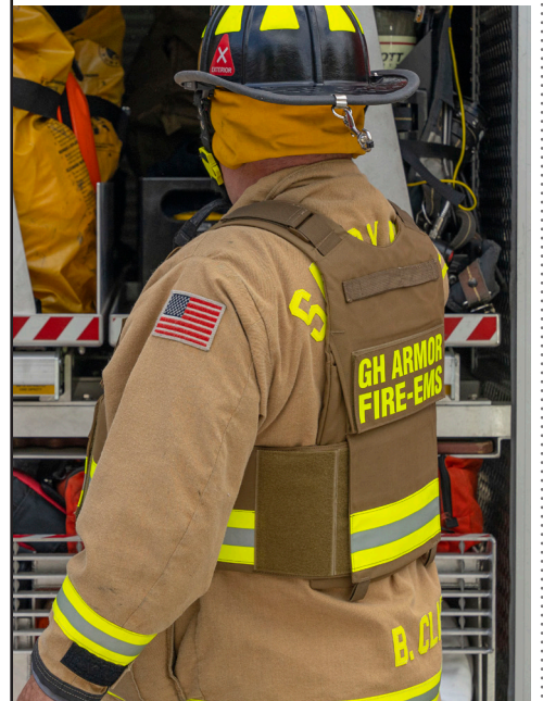
*Image shows PH4.FR style, w/out MOLLE